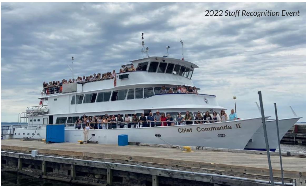
2022 Staff Recognition Event

Recognized for their years of service to the Society